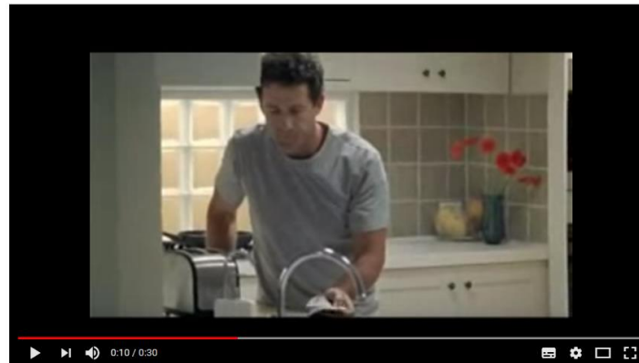
Funny St John First Aid Kit video - Australian.wmv

https://www.youtube.com/watch?v=IR8_RoShtX0 (access date: 30.10.2017)